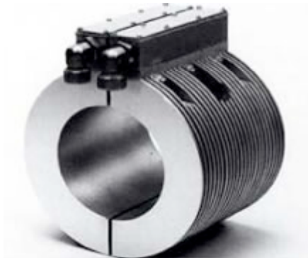
Cast Aluminium Heater